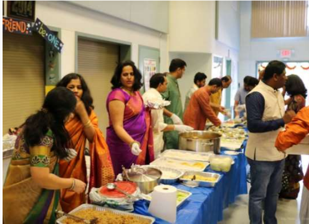
Volunteers serving food

Flower saplings were provided as part of the return gift.