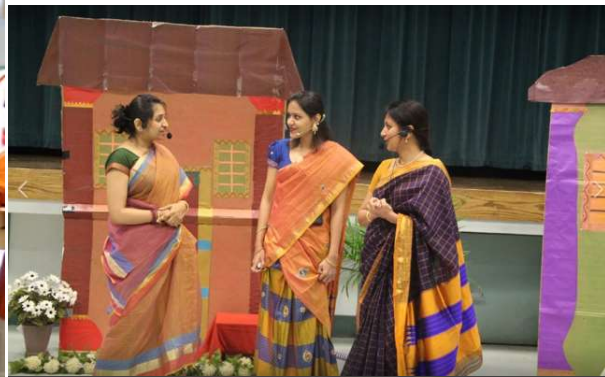
Stills from Namooru Yugadi skit